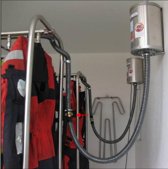
wall-mounted blower & mobile drying racks (optional) connection is made by a quick coupling