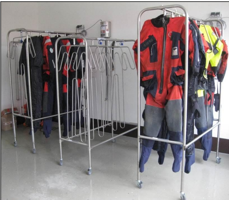
mobile version available in different heights (for service stations: standard height 185 – 195 cm)