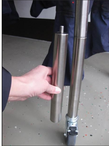
lengthening of mobile rack possible in case of need