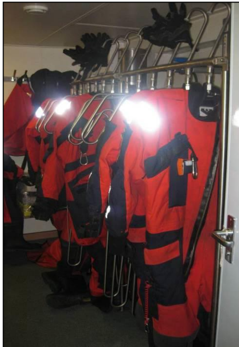
Dutch Coast Guard, NL "Barend Biesheuvel" "Zeearend" "Visarend