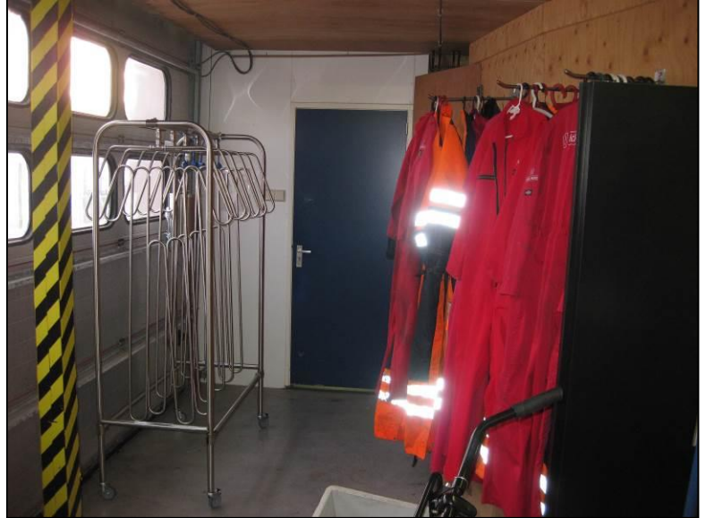
Falck Safety, Den Oever, NL (above)