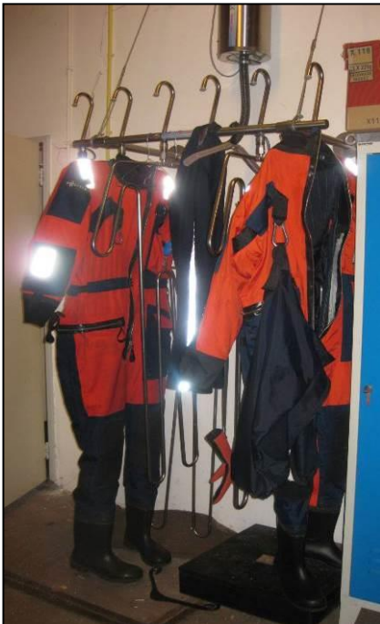
KLPD Willemstad, NL River Police