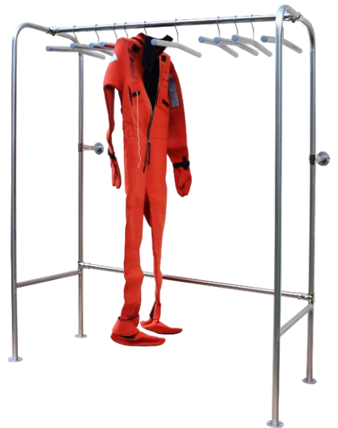
Also available: storage systems without drying function