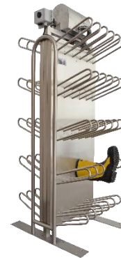
💡 available also as freestanding or mobile configuration (single or back-to-back)